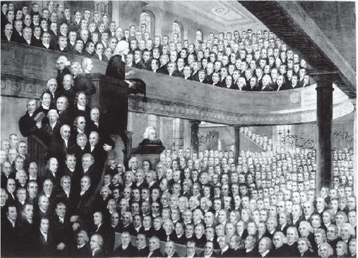
John Wesley Addressing Preachers Actual Likenesses of Preachers Used

a greater sense of nationality, was the melting pot out of which the USA was forged. This "greater sense of nationality" was the foundation upon which the nation called the United States of America was built. The USA was not built on a foundation of mortar or concrete but was laid on a foundation of tempered steel. That steel that composed the foundation of the United States of America began to be formed in the Great Awakening. You can see the hard metal of the United States of America in the characteristics of national identity precisely defined in the Declaration of Independence.