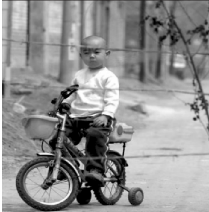
Boy looks through fence. Fearing SARS, village strung barbed wire to keep out strangers.

But look closely at the power thrown up against SARS and you get an idea of its real danger. All the power and resources and energy of the modern world are scurrying to make sure my forecast of impending doom from SARS do not materialize. The Washington Post outlined how this nation is working to protect itself. "As SARS has swept from southern China to 28 other countries, U.S. health officials have mounted an aggressive — and largely successful —