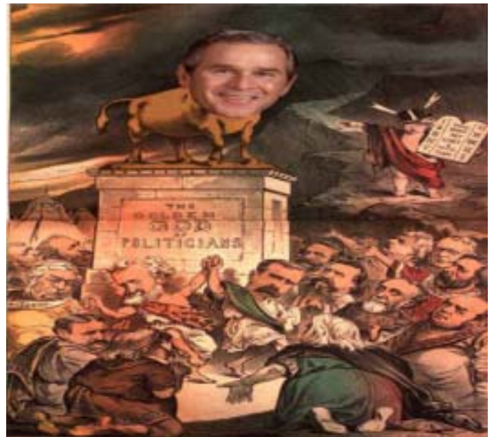
What Altar Do You Worship At?

What about you? What spirit leads you? Is it the spirit of fear? Or is it the Holy Spirit who cries out today about the horrible, legalized butchering of His children in the United States of America? One thing is for certain, how you respond to this issue of the Abortion Abolitionist magazine will go a long way toward demonstrating conclusively which spirit you serve. END