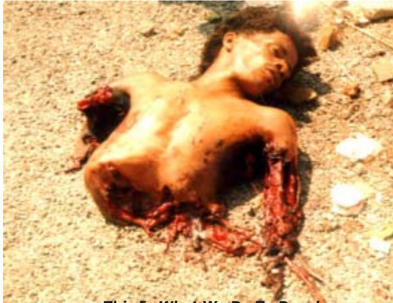
This Is What We Do To People Who Unjustly Kill Born Americans

God is the Spirit of Truth. He will not abide with nor empower those who refuse to walk in the truth.